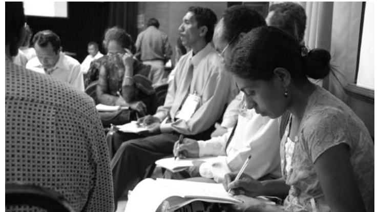
Participants from Bobonaro District at the National Workshop discuss their experiences with LDP.

Minister for State Administration and Territorial Ordinance Dr. Arcângelo Leite addressed participants saying, "The Government's objective is to accelerate the decentralization policy. We need to look for how to fix those things which are not working, and to